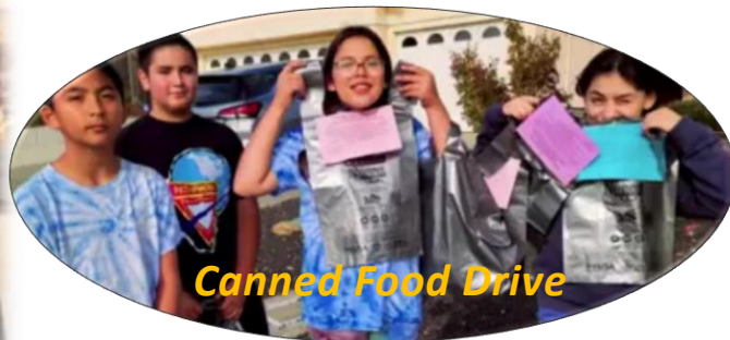
Canned Food Drive